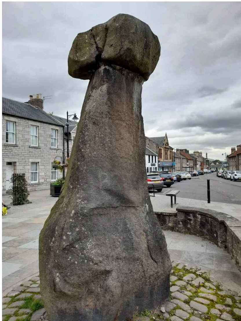
Stone Of Mannan, Clackmannan